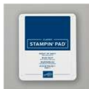
Night Of Navy Classic Stampin' Pad - 147110