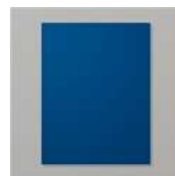
Night Of Navy 8-1/2" X 11" Cardstock - 100867