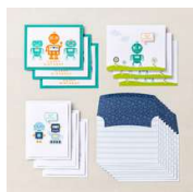
Robot Buddies Kids Card Kit (English) - 159336