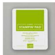
Granny Apple Green Classic Stampin' Pad - 147095