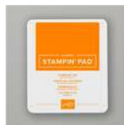
Pumpkin Pie Classic Stampin' Pad - 147086