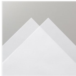
Vellum 8-1/2" X 11" Cardstock - 101856