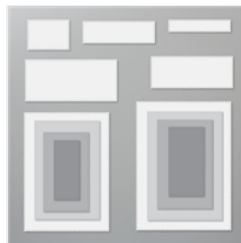
Rectangle Stitched Dies - 151820