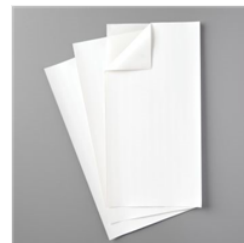
Adhesive Sheets - 152334