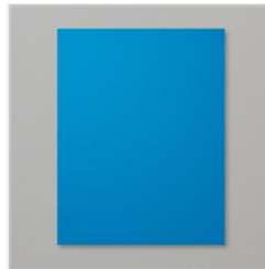
Pacific Point 8-1/2" X 11" Cardstock - 111350