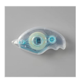
Stampin' Seal -152813