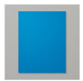
Pacific Point 8-1/2" X 11" Cardstock -111350