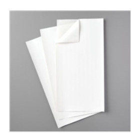
Adhesive Sheets - 152334