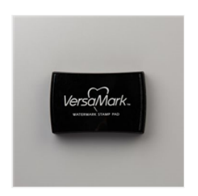
Versamark Pad -102283