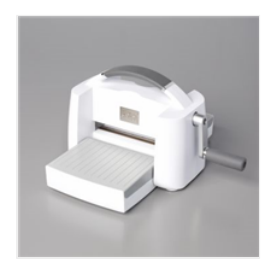
Stampin' Cut & Emboss Machine -149653