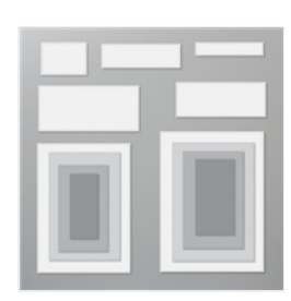
Rectangle Stitched Dies - 151820