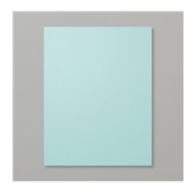
Pool Party 8-1/2" X 11" Cardstock -122924