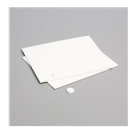
Stampin' Dimensionals -104430