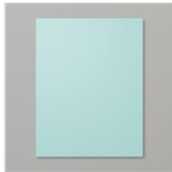
Pool Party 8-1/2" X 11" Cardstock - 122924