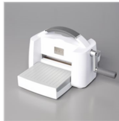
Stampin' Cut & Emboss Machine - 149653