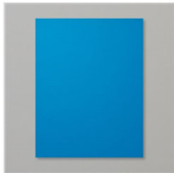
Pacific Point 8-1/2" X 11" Cardstock - 111350