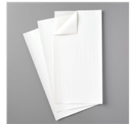
Adhesive Sheets - 152334