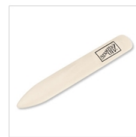
Bone Folder 102300