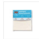
Stampin' Dimensionals 104430