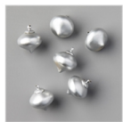
Mini Ornaments 144626