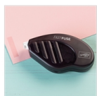
Fast Fuse Adhesive 129026