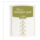
Old Olive Classic Stampin' Pad 126953