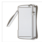
Stampin' Trimmer 126889