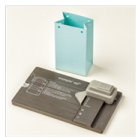
Gift Bag Punch Board 135862