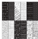
Merry Music Specialty Designer Series Paper 144623