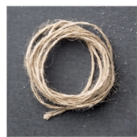
Linen Thread 104199