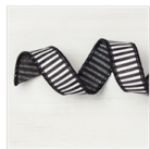
7/8" (2.2 Cm) Striped Ribbon 144624