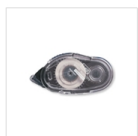
Snail Adhesive 104332