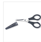
Paper Snips 103579