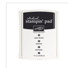
Basic Black Archival Stampin' Pad 140931