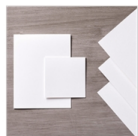
Whisper White 8-1/2" X 11" Thick Cardstock 140272