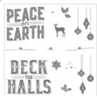
Carols Of Christmas Clear-Mount Stamp Set 144804