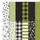
Merry Little Christmas Designer Series Paper 144621