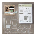
Coffee Café Photopolymer Bundle 145331