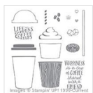
Coffee Café Photopolymer Stamp Set 143677