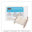
Embossing Buddy 103083