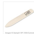
Bone Folder 102300