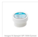
White Stampin' Emboss Powder 109132