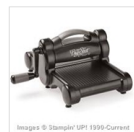
Big Shot 143263