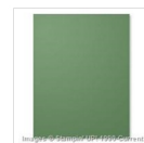
Garden Green 8-1/2" X 11" Cardstock 102584