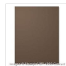
Early Espresso 8-1/2" X 11" Cardstock 119686