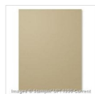
Crumb Cake 8-1/2" X 11" Cardstock 120953