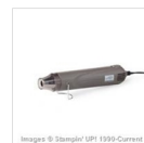
Heat Tool (Us And Canada) 129053