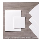
Whisper White 8-1/2" X 11" Thick Cardstock 140272