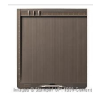
Simply Scored 122334