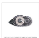
Snail Adhesive 104332