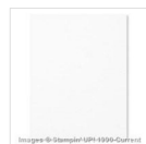
Whisper White 8-1/2" X 11" Cardstock 100730