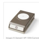
2" (5.1 Cm) Circle Punch 133782