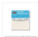
Stampin' Dimensionals 104430