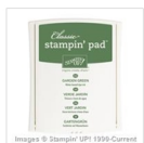
Garden Green Classic Stampin' Pad 126973