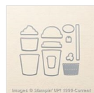
Coffee Cups Framelits Dies 143745