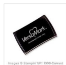
VersaMark Pad 102283