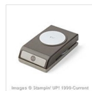
2-1/4" (5.7 Cm) Circle Punch 143720