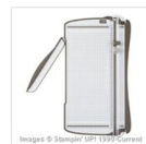
Stampin' Trimmer 126889