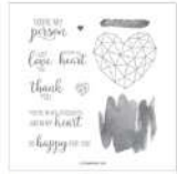
Modern Heart Cling Stamp Set 149328