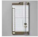
Paper Trimmer 152392