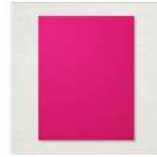
Lovely Lipstick 8-1/2" X 11" Cardstock 146970