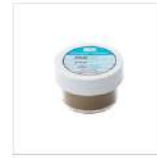
Gold Stampin' Emboss Powder 109129