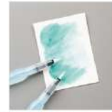
Fluid 100 Watercolor Paper 149612