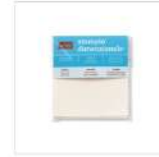
Stampin' Dimensionals 104430