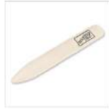
Bone Folder 102300