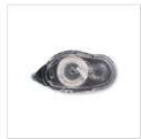
Snail Adhesive 104332