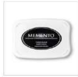
Tuxedo Black Memento Ink Pad 132708