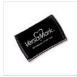
Versamark Pad 102283