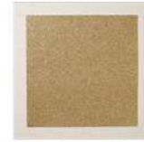
Gold Glimmer Paper 146958