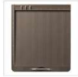
Simply Scored 122334