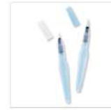
Aqua Painters 103954