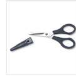
Paper Snips 103579