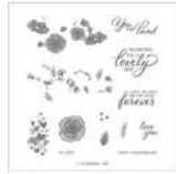
Forever Lovely Photopolymer Stamp Set 148624