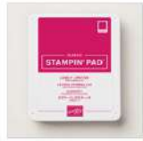
Lovely Lipstick Classic Stampin' Pad 147140