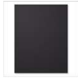
Basic Black 8-1/2" X 11" Cardstock 121045