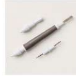
Take Your Pick 144107