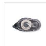
Snail Adhesive 104332