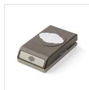
Pretty Label Punch 143715