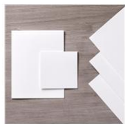
Whisper White 8-1/2" X 11" Thick Cardstock 140272