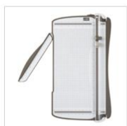
Stampin' Trimmer 126889