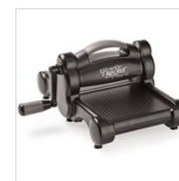
Big Shot 143263