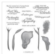
Lasting Lily Photopolymer Stamp Set 149717

visit CraftyStampin.com or http://bit.ly/shopSUonline