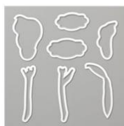
Lily Framelits Dies 150071