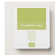
Pear Pizzazz Classic Stampin' Pad 147104