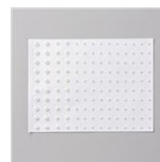
Pearl Basic Jewels 144219