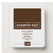
Early Espresso Classic Stampin' Pad 147114