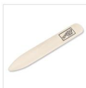
Bone Folder 102300