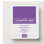
Gorgeous Grape Classic Stampin' Pad 147099