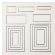
Rectangle Stitched Framelits Dies 148551