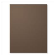
Early Espresso 8-1/2" X 11" Cardstock 119686