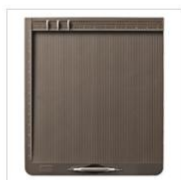
Simply Scored 122334