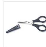
Paper Snips 103579