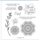
Dear Doily Cling Stamp Set 148690