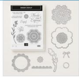
Dear Doily Cling Bundle 150616