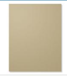
Crumb Cake 8-1/2" X 11" Cardstock 120953