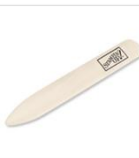
Bone Folder 102300