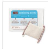
Embossing Buddy 103083