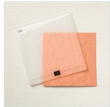
Lace Dynamic Textured Impressions Embossing Folder 148530