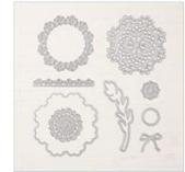
Doily Builder Thinlits Dies 148553