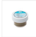
Gold Stampin' Emboss Powder 109129