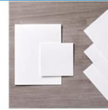
Whisper White 8-1/2" X 11" Thick Cardstock 140272