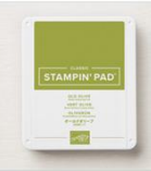
Old Olive Classic Stampin' Pad 147090