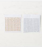
Metallic Pearls 146282