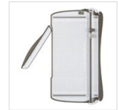
Stampin' Trimmer 126889