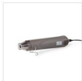
Heat Tool (Us And Canada) 129053