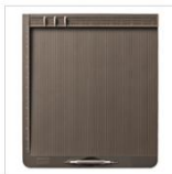
Simply Scored 122334