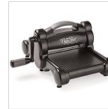
Big Shot 143263