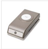
1-1/4" (3.2 Cm) Circle Punch 119861