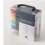
Many Marvelous Markers 147154