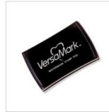
VersaMark Pad 102283