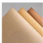
Brushed Metallic Cardstock