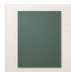
Evening Evergreen 8-1/2" X 11" Cardstock