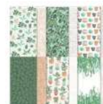
Bloom Where You're Planted 12" X 12" (30.5 X 30.5 Cm) Designer Series Paper