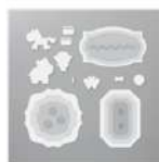
Hippo & Friends Dies