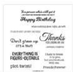
Lighthearted Lines Cling Stamp Set