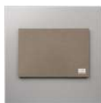
Stampin' Pierce Mat