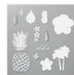
In The Tropics Dies