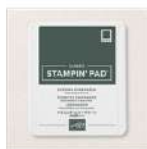
Evening Evergreen Classic Stampin' Pad