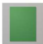
Garden Green 8-1/2" X 11" Cardstock