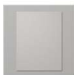
Gray Granite 8-1/2" X 11" Cardstock