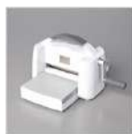
Stampin' Cut & Emboss Machine