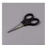
Paper Snips Scissors