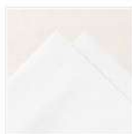
Linen 12" X 12" (30.5 X 30.5 Cm) Specialty Paper