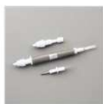
Take Your Pick