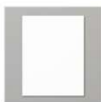
Basic White 8-1/2" X 11" Thick Cardstock