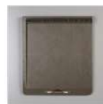
Simply Scored Scoring Tool