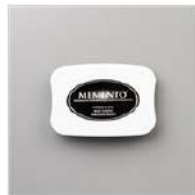
Tuxedo Black Memento Ink Pad 132708