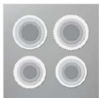
Layering Circles Dies 151770