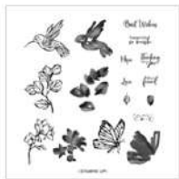
A Touch Of Ink Photopolymer Stamp Set (English) 155233