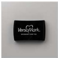
Versamark Pad 102283