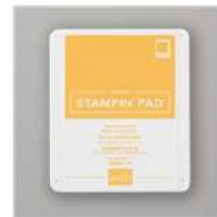
Bumblebee Classic Stampin' Pad 153116