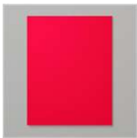
Poppy Parade 8-1/2" X 11" Cardstock 119793