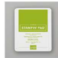
Granny Apple Green Classic Stampin' Pad 147095