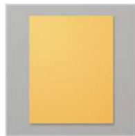
Bumblebee 8-1/2" X 11" Cardstock 153077