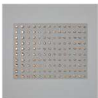
Champagne Rhinestone Basic Jewels 151193