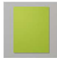
Granny Apple Green 8-1/2" X 11" Cardstock 146990