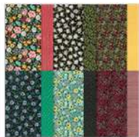
Flower & Field Designer Series Paper 155223