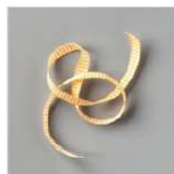
Bumblebee 1/4" (6.4Mm) Gingham Ribbon 153658