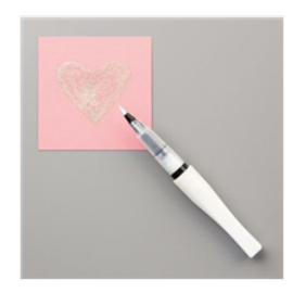
Wink Of Stella Clear Glitter Brush