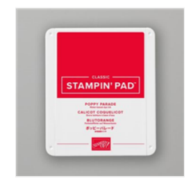
Poppy Parade Classic Stampin' Pad