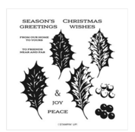
Leaves Of Holly Photopolymer Stamp Set (English)