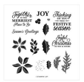
Merriest Moments Photopolymer Stamp Set (English)