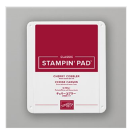
Cherry Cobbler Classic Stampin' Pad