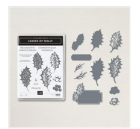
Leaves Of Holly Bundle (English)