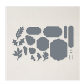
Seasonal Labels Dies