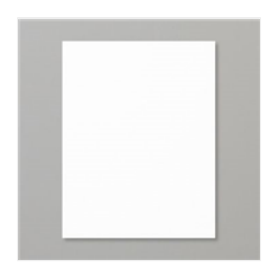
Shimmery White 8-1/2" X 11" Cardstock