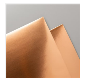
Copper Foil Sheets