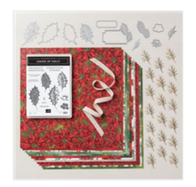
Boughs Of Holly Suite Collection (English)