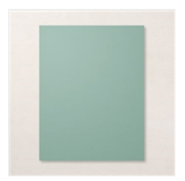
Soft Succulent 8-1/2" X 11" Cardstock